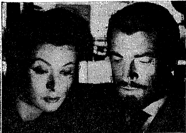
Greer Garson and Walter Pidgeon in a tense scene from the thrilling love story of Marie and Pierre Curie, "Madame Curie," with an all star cast.

SHIRTS • TIES • HANDKERCHIEFS • UNDERWEAR • SPORT SHIRTS ★ BUY WAR BONDS AND STAMPS ★