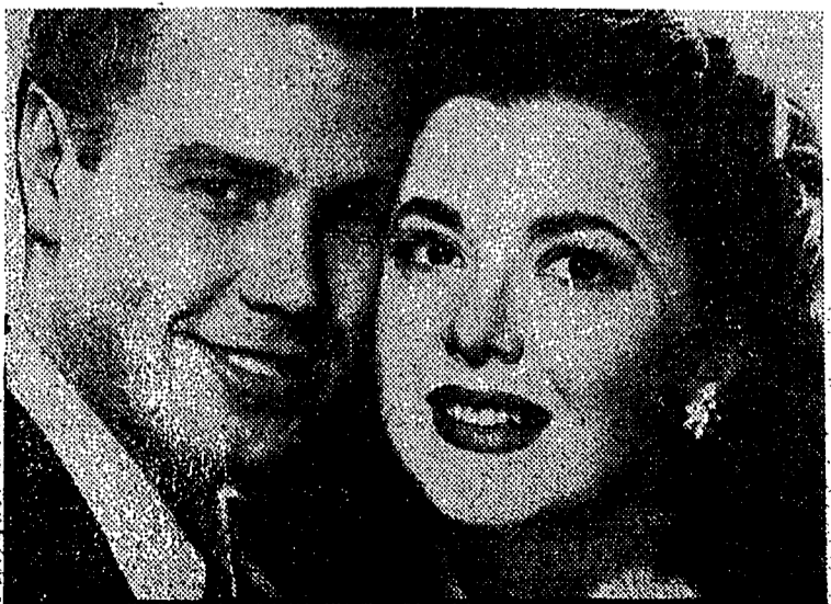
Richard Crane and Ann Rutherford are the young lovers in "Happy Land," thrilling story by MacKinnon Kantor, with Don Ameche and Frances Dee.