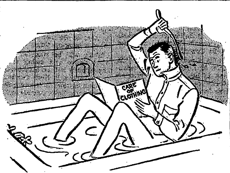
"Turn up shirt collars before washing them . . ."

Whether Froth is to rise from this grave will be decided by a poll to sound out public opinion. Froth will resume publication only if enough servicemen and students sign petitions at Student Union.