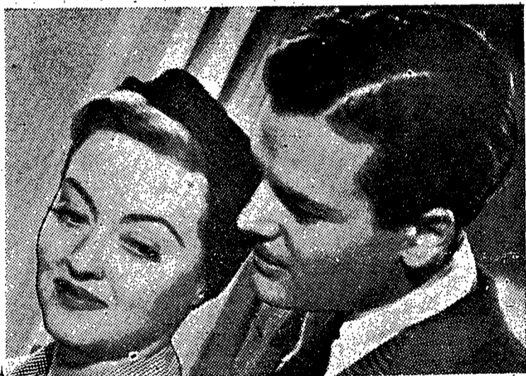
Bette Davis, in her most stirring role, is shown in this scene from her latest picture, "Old Acquaintance," starting at the Cathaum, Saturday, with Gig Young and Miriam Hopkins