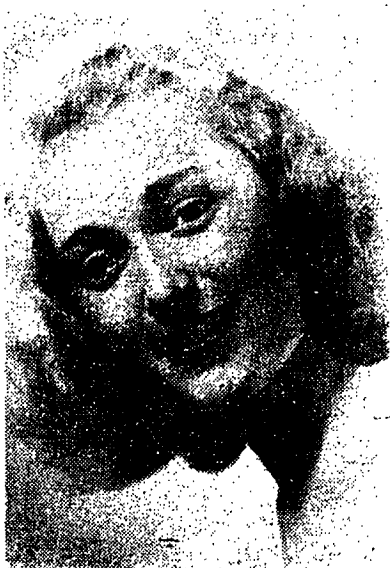
Squadron C—Sally Meyers