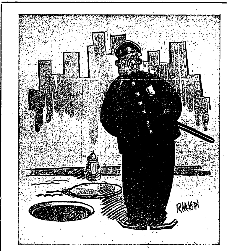
This Cop Is Happy; He's Read The Penn State Engineer