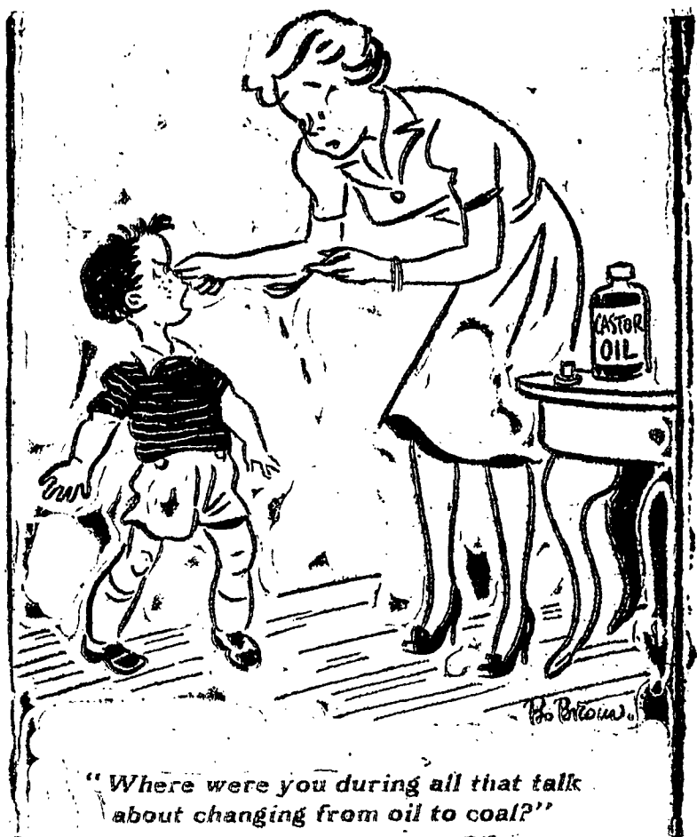
"Where were you during all that talk about changing from oil to coal?"

Previously scheduled by the Nittanymen for season openers, Dickinson and Western Maryland were dropped from the schedule when it was impossible for them to make arrangements to travel to Penn State. The Colgate Red Raiders and the Cadets from West Point also had games on the card that had to be rubbed out for wartime reasons.