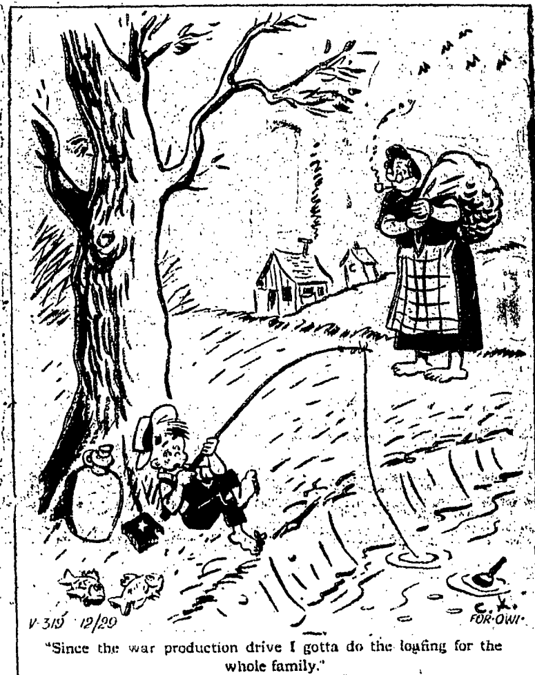
"Since the war production drive I gotta do the looking for the whole family."

IN PEACE...SOURCE OF SUPPLY FOR THE BELL SYSTEM. IN WAR...ARSENAL OF COMMUNICATIONS EQUIPMENT.