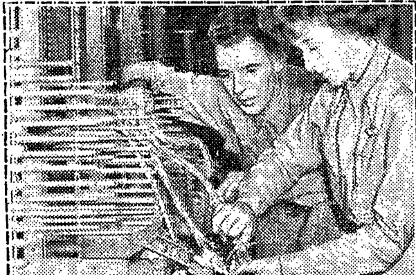
WAAC learning line testing