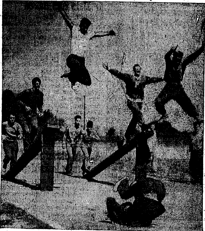
Flushing, L. I., high school Commandos run off plank, vault high, finish with full somersault as part of pre-military hardening program. In size about the same as Penn State's School of Physical Education obstacle course, the Flushing course is over 100 yards long.