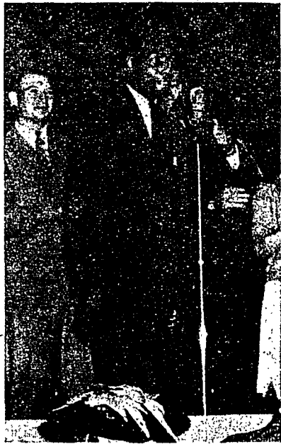
Election of trustees, luncheons, reunions, athletic events, sight-seeing tours—all these are important parts of the annual Alumni Day activities. Above, Norwood H. (Barney) Ewell, whose flying feet have brought Penn State much nation-wide attention, addresses a group of alumni at a luncheon.