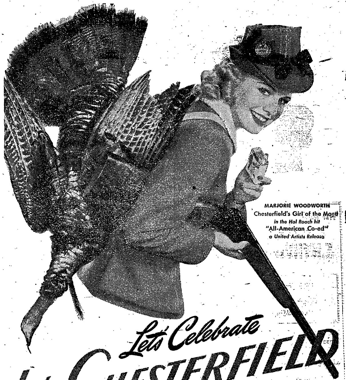
MARJORIE WOODWORTH Chesterfield's Girl of the Month in the Hal Roach hit "All-American Co-ed" a United Artists Release