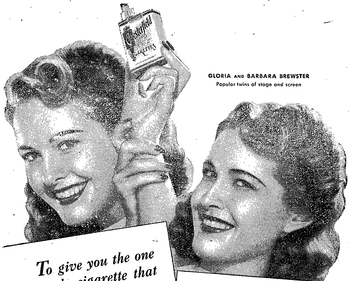
GLORIA AND BARBARA BREWSTER Popular twins of stage and screen

MORNING STAR, TRU-WHEAT PURITY BREAD and TROPHY WINNER CAKE