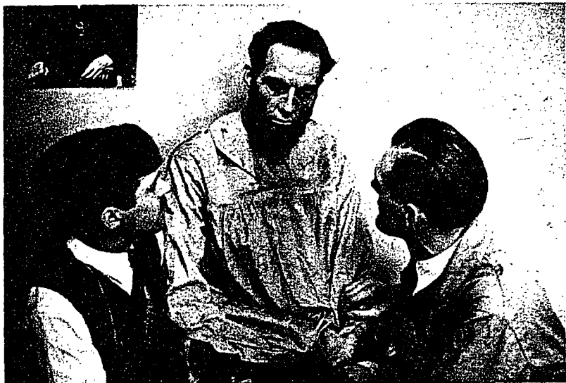
... to become a "dead ringer" for the "Great Emancipator"