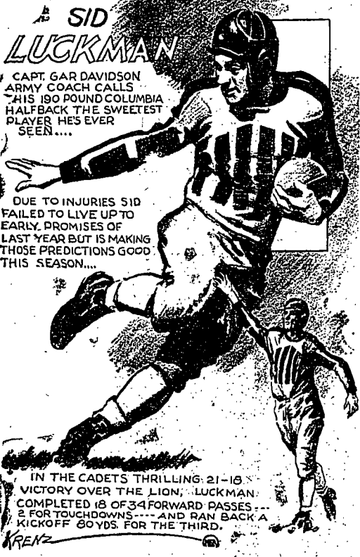
A SID LUCKMAN