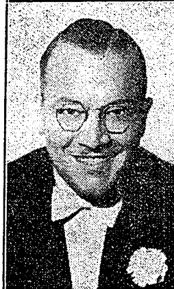
PEE-WEE HUNT Whose whimsical humor will enliven everyone.