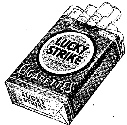
THE FINEST TOBACCO—"THE CREAM OF THE CROP"

Miss Stanwyck verifies the wisdom of this preference, and so do other leading artists of the radio, stage, screen and opera.