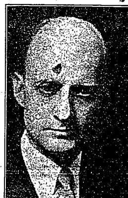
REINHOLD NIEBUHR Visiting Lecturer