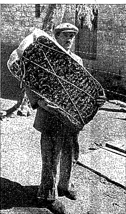
A bale of aromatic Chesterfield Turkish tobacco.