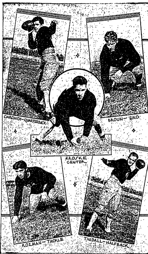
Lions, Opponents Who Will Start Saturday