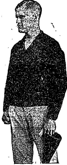
Coach Carl Snavelly