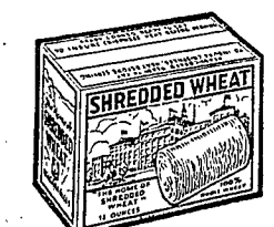
When you see Niagara Falls on the package, you KNOW you have Shredded Wheat.

SHREDDED WHEAT is all the wheat. All its nourishing goodness. All the bran that Nature provides. And in a most delightful form... ready cooked, ready-to-eat biscuits with a satisfying nut-like flavor.