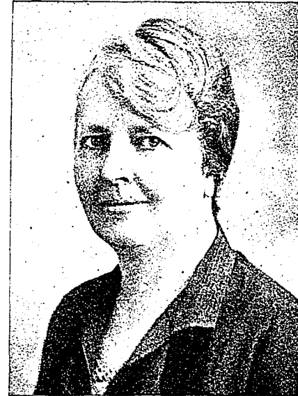
Miss Charlotte E. Ray