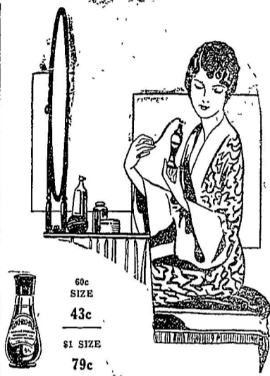
60c SIZE 43c $1 SIZE 79c