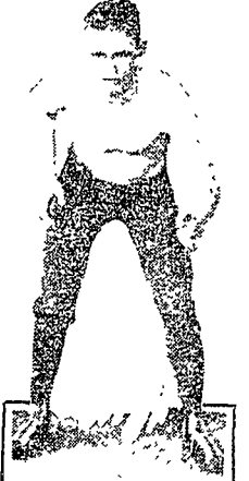
WILBUR HILL, Iowa