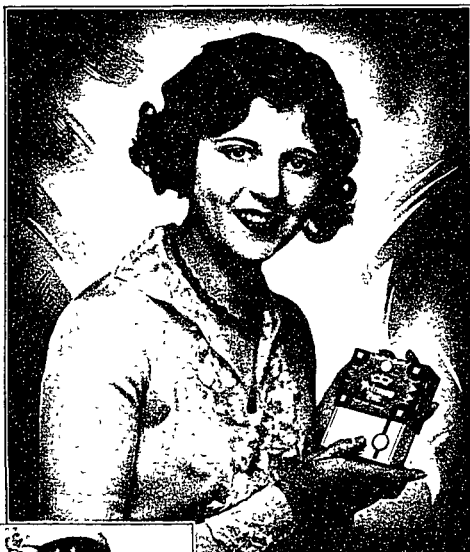
Dorothy Gulliver, famous Universal film star, registers here delight every time she opens a box of Princess Pat Powder. The exclusive discoverer seems to make an especial hit with this noted actress.