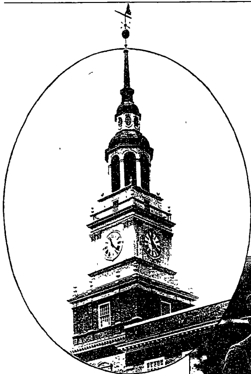
A New Tower Rises on Dartmouth Campus—It tops the new million-dollar Baker Memorial Library—a beautiful example of the simpler type of Colonial Georgian architecture. The new library has accommodations for 550,000 books and its reading rooms can seat 1,000 students. It is the gift of George F. Baker.