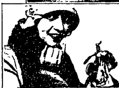
"Princess Pat Top-It, the new, smart, loose powder and lip rouge container, is certainly a clever idea. So convenient, locks away in the smallest purse, and is truly spirit-proof."

WINTER . . . cold, nipping winds, pastures that take you in and out of doors . . . zestful, blunful days of sports, of dances, of pleasure, but so hard upon your skin . . . so disastrous to the very beauty upon which your social success and keenest enjoyment depends.