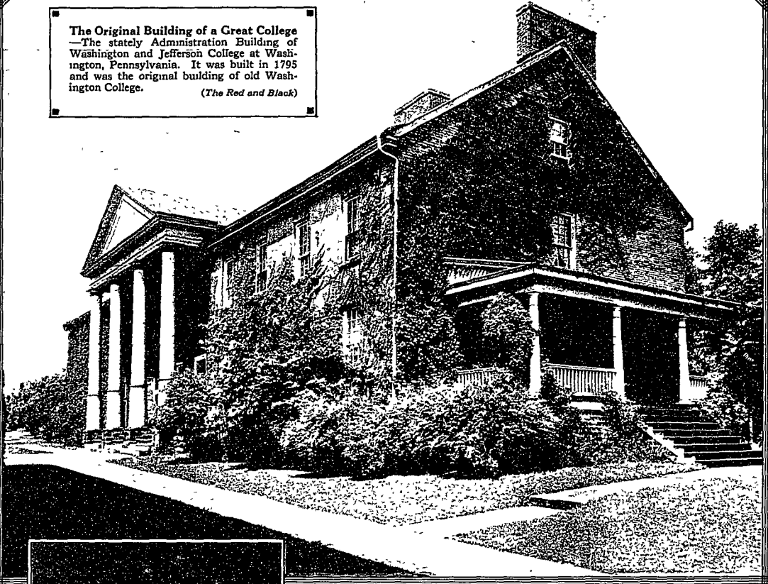
The Original Building of a Great College —The stately Administration Building of Washington and Jefferson College at Washington, Pennsylvania. It was built in 1795 and was the original building of old Washington College.