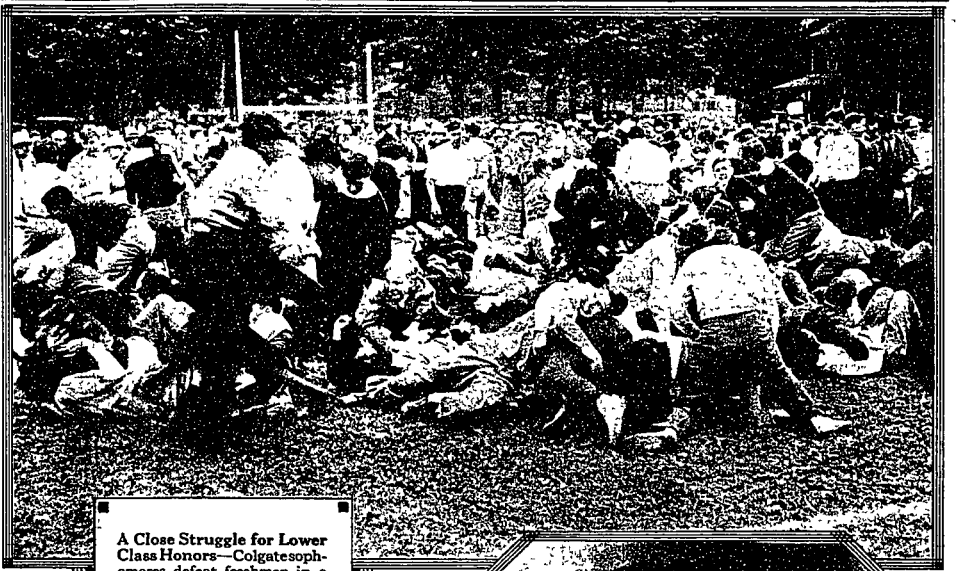
A Close Struggle for Lower Class Honors —Colgatesophomores defeat freshmen in a close struggle in the annual underclass rush. The score was 152 to 151. Senior society men—wearing white and black hats—are acting as score keepers.