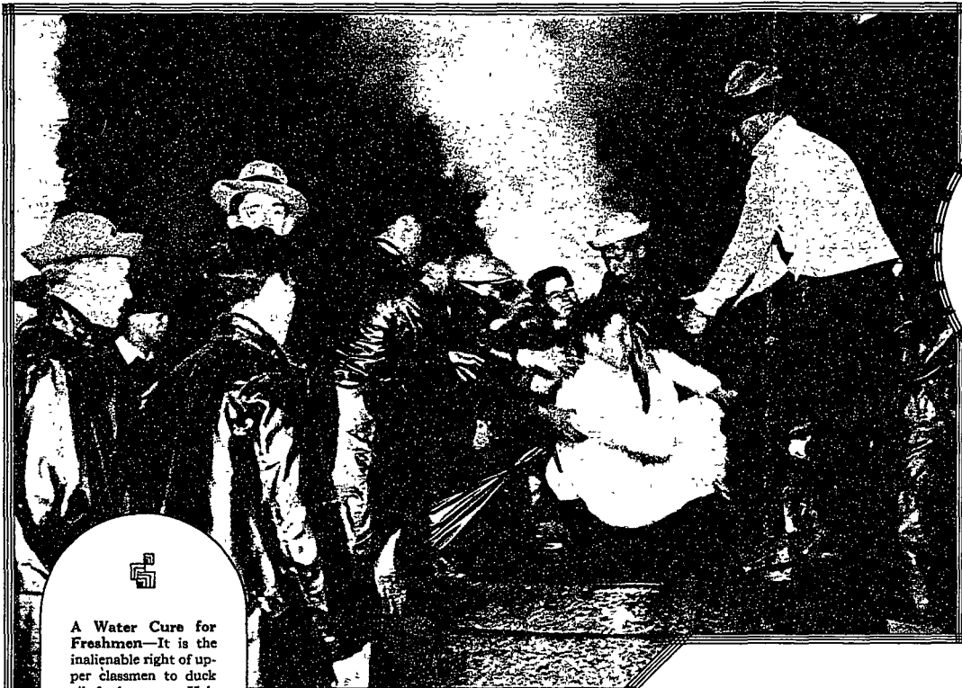
A Water Cure for Freshmen —It is the inalienable right of upper classmen to duck all freshmen on Halloween. This happens at New York University and is supposed to be good for the newcomers.