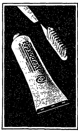
PEPSODENT—A scientific de frice compounded solely to rem dingy film from teeth.