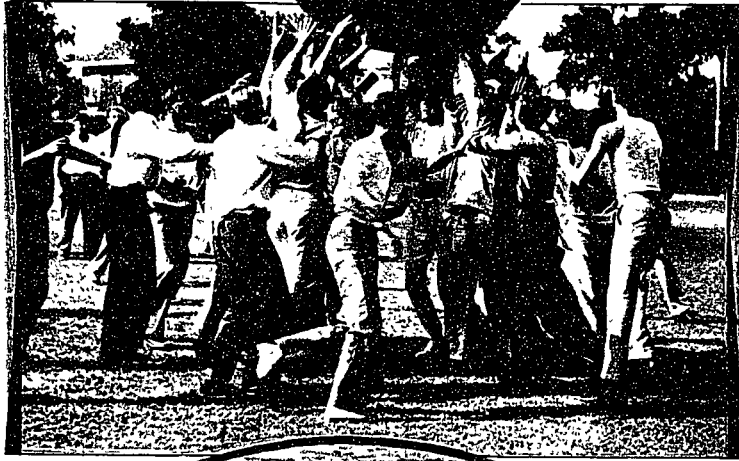
(Left) Trojan Sophomores Win Annual Brawl—The class of 1931 wins annual brawl between the two lower classes on the campus of the University of Southern California by 2 to 0. The push-ball contest pictured here resulted in a tie. It was full of fight but neither team was able to make any appreciable gain.