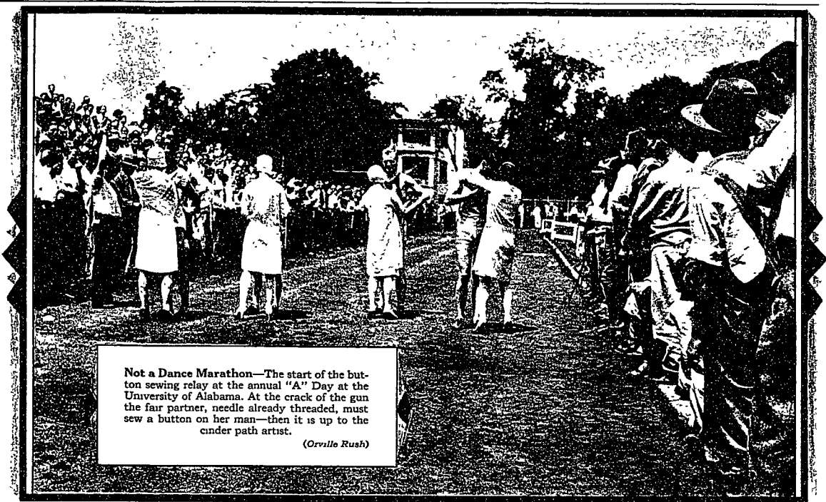
Not a Dance Marathon—The start of the button sewing relay at the annual "A" Day at the University of Alabama. At the crack of the gun the fair partner, needle already threaded, must sew a button on her man—then it is up to the cinder path artist.