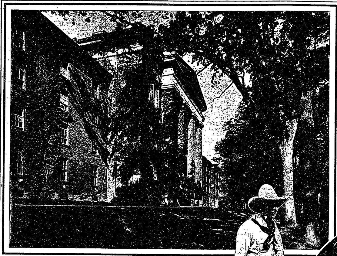
A Building of Stately Beauty —Old Main at Bucknell has been praised by architects as being one of the stateliest college buildings in America. The Bucknell campus is a thing of rare beauty on the beautiful Susquehanna River at Lewisburg, Pa.