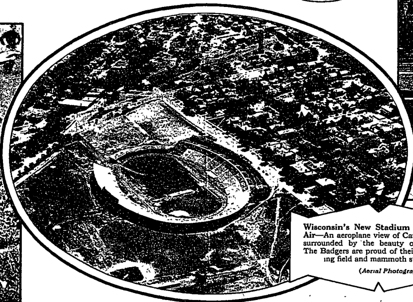
Wisconsin's New Stadium From the Air —An aeroplane view of Camp Randall surrounded by the beauty of Madison. The Badgers are proud of their new playing field and mammoth stands.