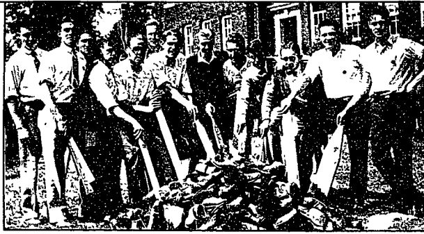
Choose Your Shoes. All ready for the annual shoe rush at the University of Cincinnati. The shoes belong to the freshmen. The paddles belong to the upper classmen. The paddles may be used ad libitum until each freshman finds and puts on his own shoes. Woe befalls the luckless "frosch" who fails to find and don his shoes with alacrity.