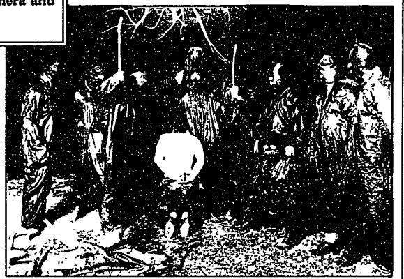
'Twas a Dark and Stormy Night! Here's a gloomy view of the "Deep Dark Mystery Club" of the University of Oklahoma at Norman. The bareback rider in the center is probably not enjoying himself at this instant—but, on the other hand, he may be having the time of his young life—it's hard to tell about such things.