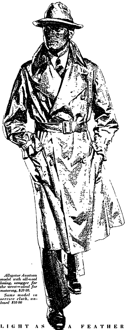
Alligator Aviation model with all-wool lining, swaggar for the street—ideal for motoring, $30.00. Same model in service cloth, unlined $10.00.