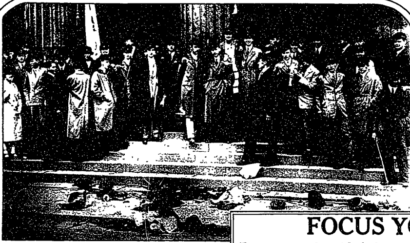
Students in Norway—throw away their emblematic caps and canes when they graduate from high school into the university.