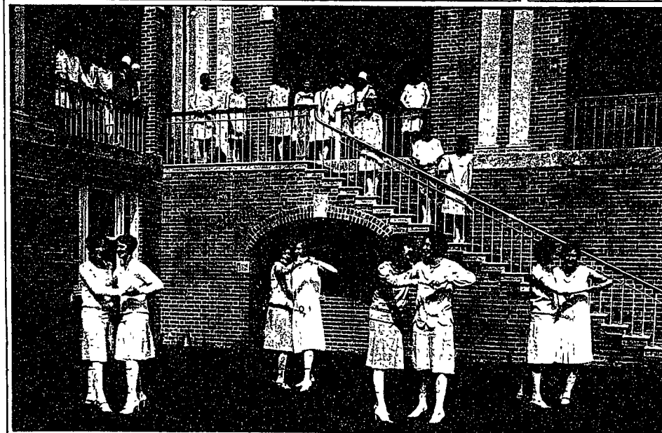
Sigma Kappa Girls Enjoy Adamless Eden at Old Point Comfort. Our photographer was at a loss to explain the strange scene at the Chamberlin Vanderbilt. Beautiful girls everywhere and not a man in sight!

THE MENTHOL HEALS.....THE HOREHOUND SOOTHES