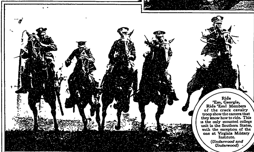
Ride 'Em, Georgia, Riders! 'Em! Members of the crack cavalry troop show the camera that they know how to ride. This is the only mounted college unit in the Southern States, with the exception of the one at Virginia Military Institute.