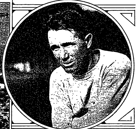
W W. A Winning Wonder from Alabama —Coach William Wallace Wade has made an enviable record with his football teams at the University of Alabama. His team lost only one game during his first year, and then won the Southern Conference championship for the next three seasons. Great expectations await his 1928 team.