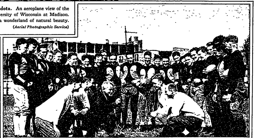
In Conference on the Midway. Coach Alonzo Stagg and his board of strategy are shown in this picture with the 1928 University of Chicago varsity squad.