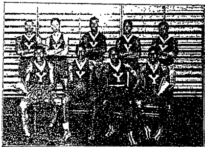
Winners of Laurels in Competition Staged Through Efforts of Y. M. C. A. in South Among Colored Population