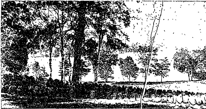
A Place of Beauty Where Religion Is Brought to One in a New and Finer Light