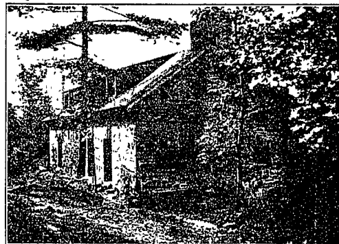
Fifty Parties Have Visited This Memorial