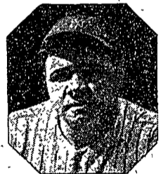
The idol of the baseball world... "The King of Swat"

BABE RUTH... making the test in the dressing room at the Yankee Stadium. He was asked to smoke each of the four leading brands, clearing his taste with black coffee between smokes. Only one question was asked: "Which one do you like best?"