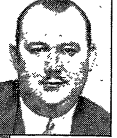
Paul Whiteman, Noted Orchestra Leader, writes:

"It was but recently, when I started to act as master of ceremonies with my band at the Paramount Theatre, that I realized how vital perfect voice condition was to a performer. I have always been a consistent smoker and, fortunately, Lucky Strikes were my favorite brand. I like their toasted flavor and, best of all, I can smoke as often as I like, without fear of irritating my voice, which is becoming a great asset in my work."