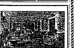
A VACATION IN THE NATION'S CAPITAL