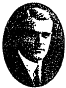
H. G. HOEHLER PIPE ORATOR

The First of the Buildings That Have Been Erected as a Result of the Emergency Building Fund Campaign, is Watts Hall. With Its Completion Comes the News that the Old Main Dormitories Will Be Abandoned.