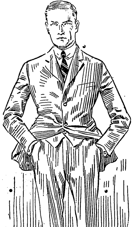
TAILORED AT FASHION PARK

The same quality standard applies to every other article of Men's Furnishings, Hats, Caps, etc., contained in our store. This sale makes possible the opportunity for you to buy the highest grade merchandise of its kind at a price which, perhaps, can never again be duplicated. Our guarantee of satisfaction goes with every purchase.