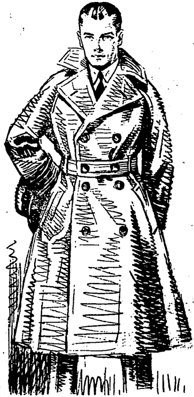
TAILORED AT FASHION PARK

T O the men and young men who appreciate the utmost in quality-- this sale is for you. It seems almost needless for us, as local merchants, to go into details concerning the high quality of merchandise handled by this store; most men of this community are familiar with this fact. But, for the benefit of those who are not, we wish to make this impress: That nowhere will you find better workmanship, better styles, or better materials (inside and out) than those found in our FASHION PARK SUITS AND OVERCOATS FOR MEN AND YOUNG MEN.