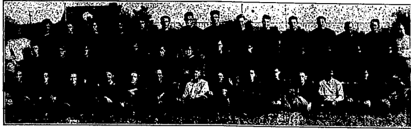
PENN STATE'S VARSITY FOOTBALL SQUAD FOR THE 1922 SEASON