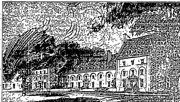
RESIDENCE GROUP FOR MEN