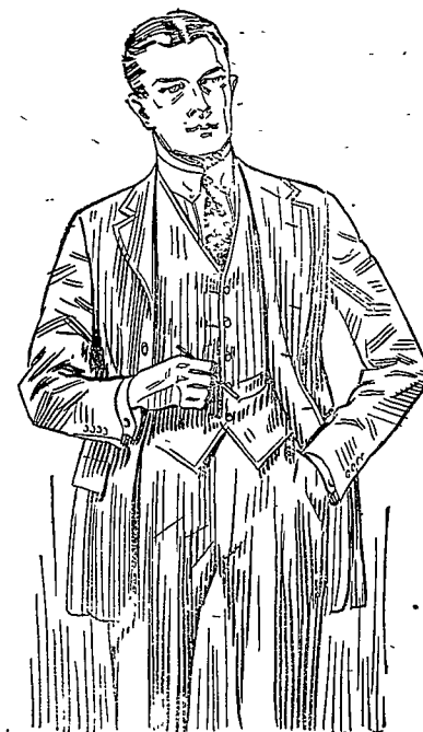
TAILORED AT FASHION PARK

The PENN STATE PHOTO SHOP State College, Pa.