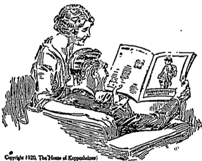
Copyright 1920, The House of Kuppenheimer

FRIDAY—Pastime GLADYS WALTON in "Pink Tights" Also half Reel Showing Alumni Home-Coming Activities at State College Nittany FLORENCE VIDOR in "The Jack Knife Man" SATURDDAY—Pastime KATHERINE McDONALD in "Passion's Playground" Nittany ETHEL CLAYTON in "A City of Sparrow" MONDAY LOUISE GLAUM in "The Leopard Woman" Also MACK SENNET COMEDY "Don't Weaken" TUESDAY BEBE DANIELS In a Sparkling Comedy "You Never Can Tell" COMING CONSTANCE TALMADGE in "The Love Expert" ANNETTE KELLERMAN in "Women Love"