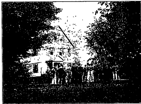
West Pointers receiving foreign delegation at Northfield

According to present indications, Penn State will be represented at the Northfield Y. M. C. A. conference by a fair sized delegation, since twelve men have already expressed their intention of attending and several more are expected to enroll shortly.