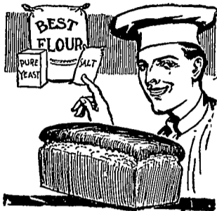
THE BEST MATERIALS

THE REGISTRAR, State College, Pennsylvania