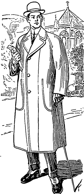
Copyright Hart Schaffner & Marx

The Sim store shows such a wide diversity of choice, assuring your particular taste and ideas to be met in these garments.