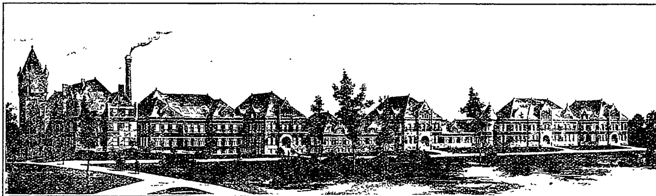
FROM THE CAMPUS SIDE