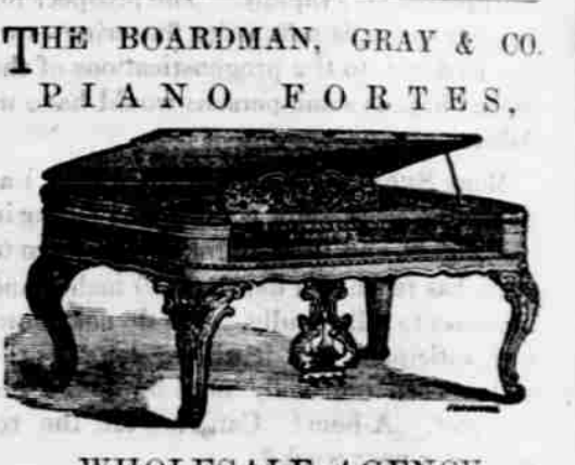
WHOLESALE AGENCY. The subscriber, late a member of this well known firm has established a WHOLESALE AGENCY, 581 Broadway, New York City.