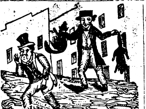
MAJORITY FOR GOVERNOR.

CONGRESS.—We have gained a member of Congress in the Armstrong district, in place of Benjamin F. Butler, elected Governor of Pennsylvania, and the members who attempted to overthrow him with base calumnies, have been crushed beneath a accumulated indignation of a honest people.